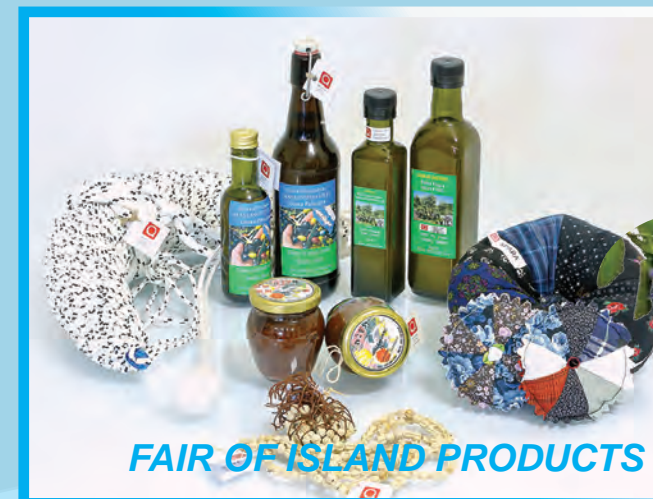
FAIR OF ISLAND PRODUCTS

Tkon contains numerous historical sites such as the parish church of St. Toma (mentioned in the 11th century, built in 1742, restored in 1938), Church of Our Lady of Seven Sorrows (built in the 18th century, located on the Kalvarija hill), St. Antun the Loner (built