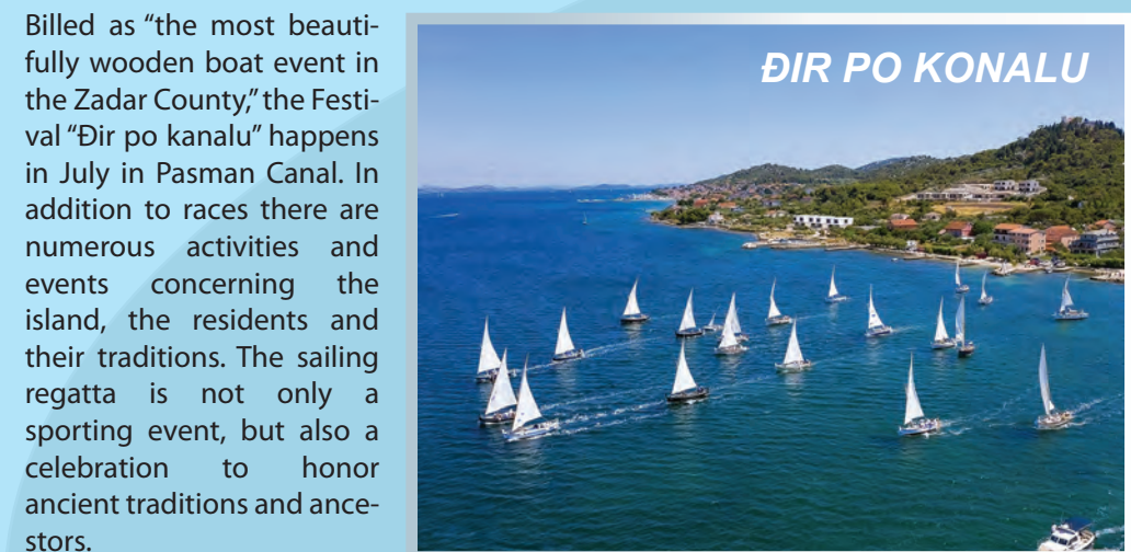
DIR PO KONALU

Ugrinić is a small fishing village next to Tkon. Many of the locals will offer you homegrown vegetables and fresh fish. The Ugrinić surrounding consists of old, non-inhabited, stone houses, which ensures an intimate and relaxing atmosphere.